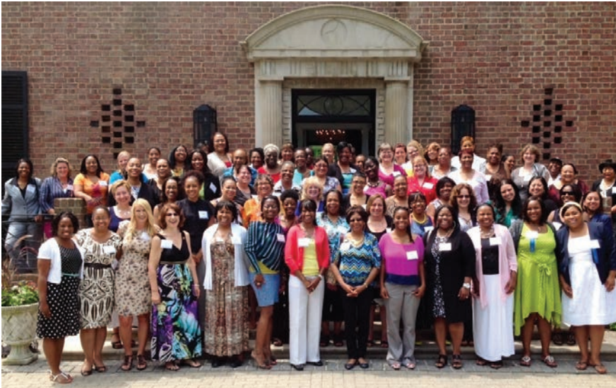
The First Annual Director's Institute at Newton White Mansion was a wonderful day of education and rejuvenation | June 25, 2013

Register Online at www.childresource.org