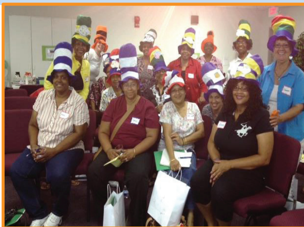
Hats for Everyone! Make-and-Take activity promoting developmentally appropriate story time. Project LAUNCH Open House, July 9.