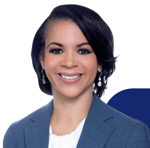
TARA H. JACKSON ACTING COUNTY EXECUTIVE PRINCE GEORGE'S COUNTY